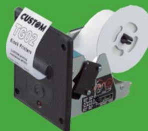
35mm paper width