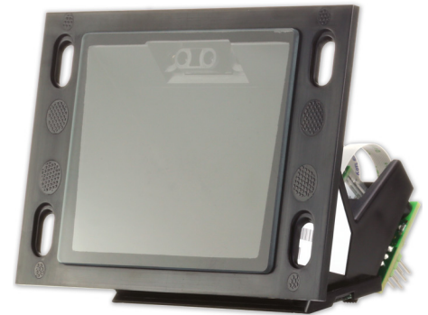
CF4680 Imager Module

The CF4680 2D Imager Module offers close-to-contact scanning operation so that end-users can intuitively read any standard 1D or 2D barcode by simply approaching or touching the CF4680 2D Imager Module's built-in exit window with their mobile phone screen, coupon, loyalty card or ticket. To eliminate unnecessary LED illumination when end-users are not using the equipment, the CF4680 2D Imager Module is equipped with an installer-selectable distance switch which will not illuminate the LED until the end-user approaches the near-field zone.